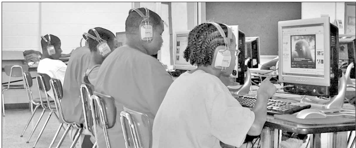
Club members participate in technology activities in the computer lab.

Volunteer Opportunities: High energy individuals or groups to help with various tasks including: tutorial, recreation and sports, coaches, officials, scorekeepers, leadership development, photography, culinary arts, martial arts, arts and crafts, music, drama, dance, administrative, board of directors, fundraising, clerical support, computer network management, maintenance, custodial, landscaping, plumbing, painting, and repairs.