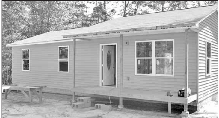
Habitat home under construction in 2008.

Volunteer Opportunities: Volunteers are used in all phases of construction - no experience is necessary. Additionally, there are opportunities to serve on the Board of Directors, committees and projects. Much of the non-construction work can be done at home. You will find it very rewarding and fun!