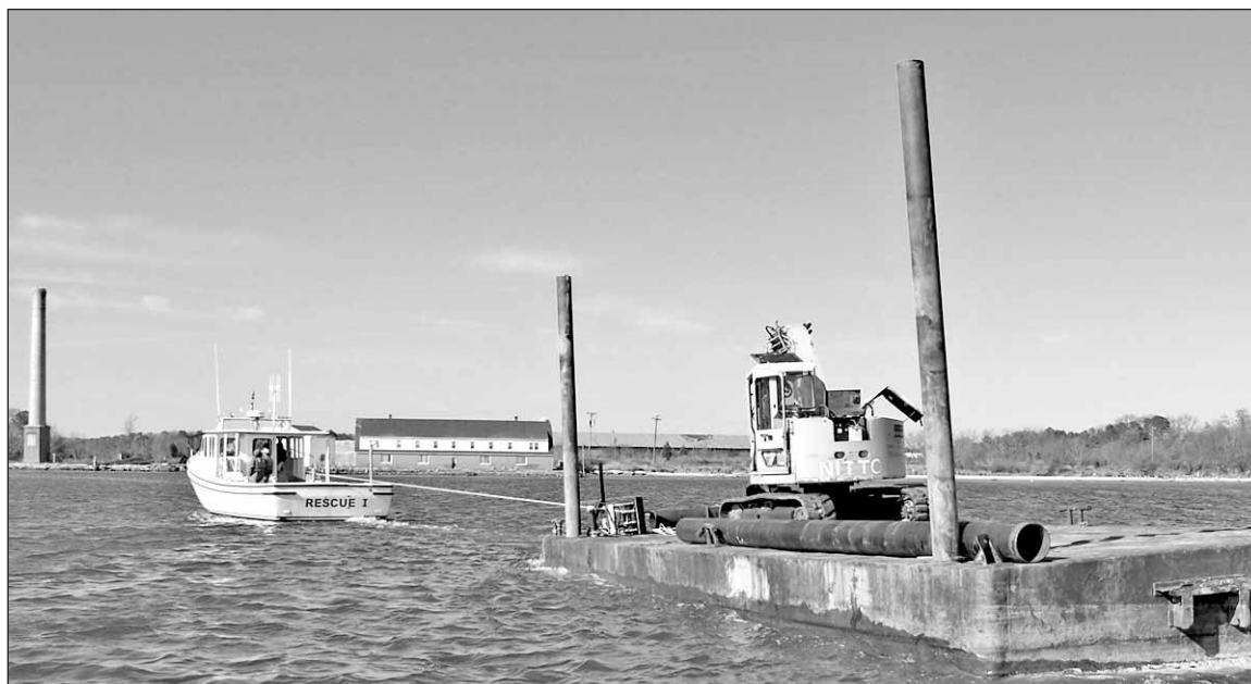
Smith Point Sea Rescue towing a barge.

Volunteer Opportunities: Smith Point Sea Rescue is an all volunteer group. Members share duties year round, 24 hours a day to maintain equipment, conduct training, and respond to search and rescue missions. New members are interviewed to establish familiarity with vessel operations and experience. New members are accepted as needed.