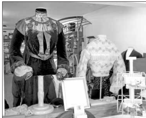
Period clothing display at the museum.

Volunteer Opportunities: Activities include operation of the county museum, presentation of special exhibits, preservation of Puller Park, and public educational programs. Docents, speakers, program coordinators, facility maintenance, and exhibit curators are needed.