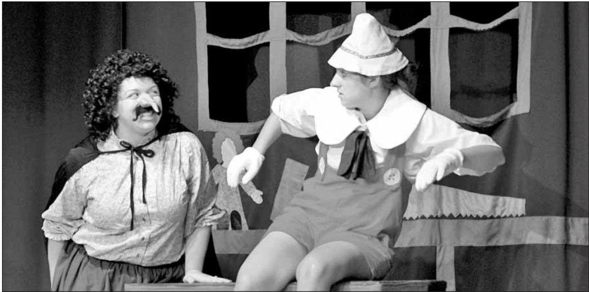
The summer drama camp production of "Pinocchio" with the Missoula Children's Theatre.

Volunteer Opportunities: The Players is a totally volunteer run organization and we need actors, set builders, techies, backstage crew, front-of-house people, painters, sewers, bakers, computer experts, fund-raisers, etc. IF you volunteer with our theatre, we'll find a fit for you!