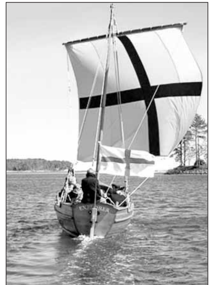
Explorer under sail.

Volunteer Opportunities: Maintaining grounds and building, gardening, boat workshops, helping with exhibits and special events, gathering artifacts.