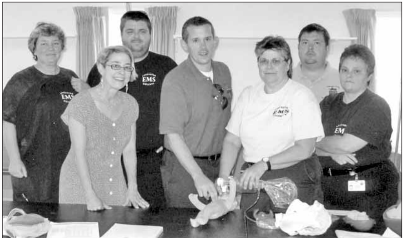
Lancaster Emergency Medical Service training workshop for obstetrical emergencies.

Volunteer Opportunities: Knitting baby caps, blankets and shawls, participate in a variety of volunteer committees that provide loving care and support to our clients